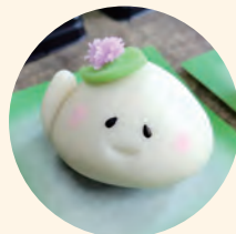
Shiraishi Japanese sweets shop Local mascot sweets