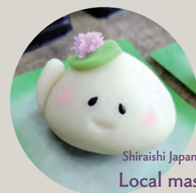
Shiraishi Japanese sweets shop Local mascot sweets